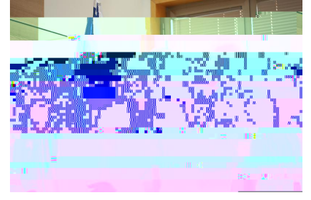
CU Students Ellysse Dick and Samuel Lentz with Knesset MP, Boaz Toporovsky

national village of <u>Neve Shalom/Wahat al-Salam</u>.